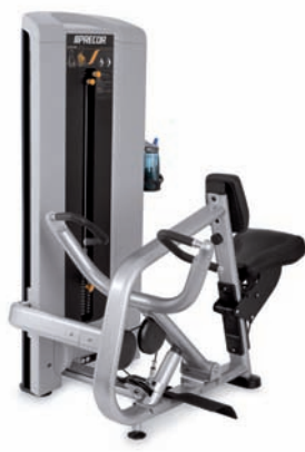
C310EC Seated Row