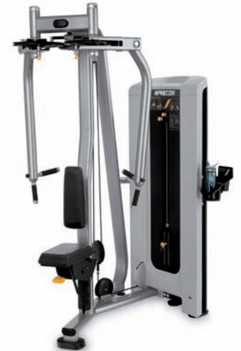
C505EC Rear Delt / Pec Fly