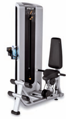
C623EC Calf Extension