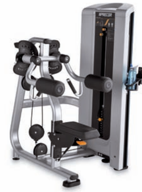
C504EC Lateral Raise