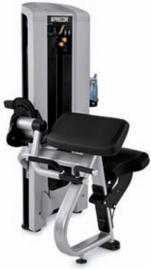
C204EC Bicep Curl