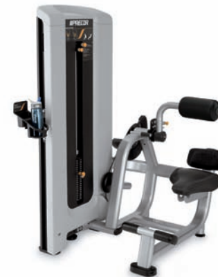
C313EC Back Extension