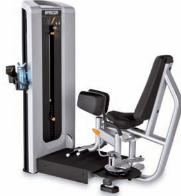
C620EC Inner Thigh