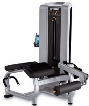
C606EC Prone Leg Curl