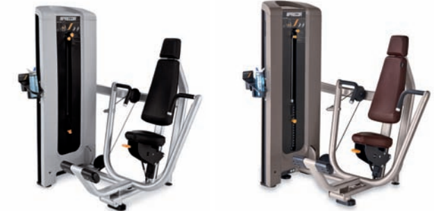
Shroud front: Silver Gray Shroud back: Pacific Blue/Gray Frame: Titanium Experience Upholstery: Black