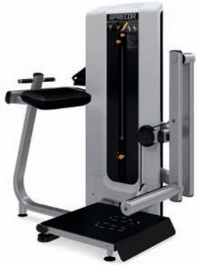
C618EC Glute Extension