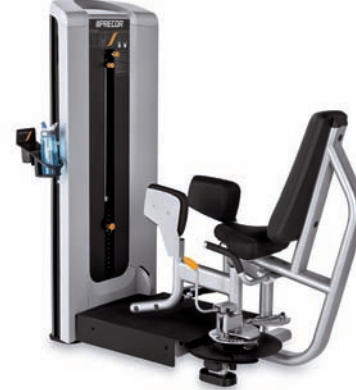
C621EC Outer Thigh