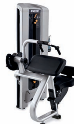
C208EC Tricep Extension