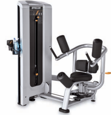
C315EC Rotary Torso