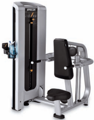
C215EC Seated Dip