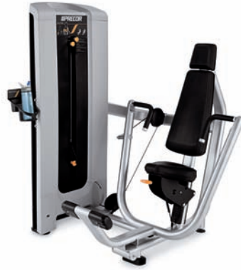
C404EC Chest Press