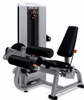
C619EC Seated Leg Curl