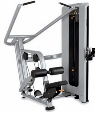
C304EC Lat Pulldown