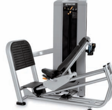
C602EC Leg Press