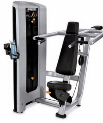
C500EC Shoulder Press