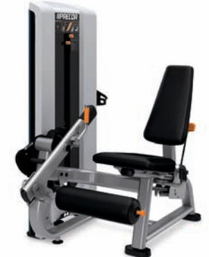
C605EC Leg Extension